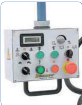
Easy pre-selection of the speed step by gear selector switch, speed adjustment by potentiometer.