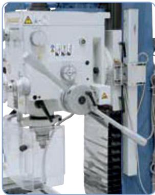
Spindle feed can be set to 0.10 / 0.18 or 0.26 mm.