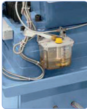
Central lubrication for all guideways come standard.