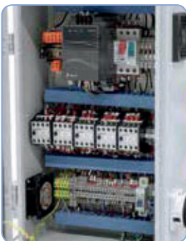
Frequency inverter allows for stepless adjustment of spindle speed

Including 3-axis digital readout with LCD-display