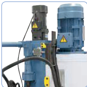
Lifting motor, as part of standard accessories, allows for convenient adjustment of mill head