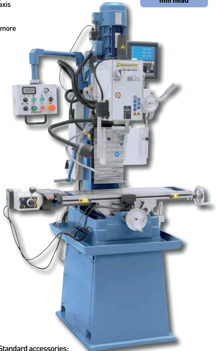
Large cross table features T-slots and coolant groove. Picture shows serially milling table power feed AL 450 D.