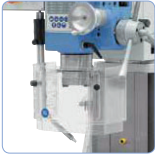
Height adjustable chuck guard and micro switch guarantees high safety standards.