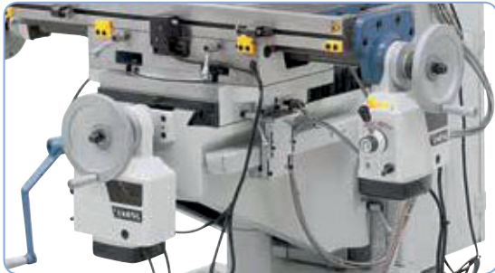
Serially equipped with automatic table feed for x and y-axis