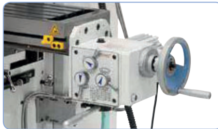
Complete with longitudinal table feed including rapid feed function.