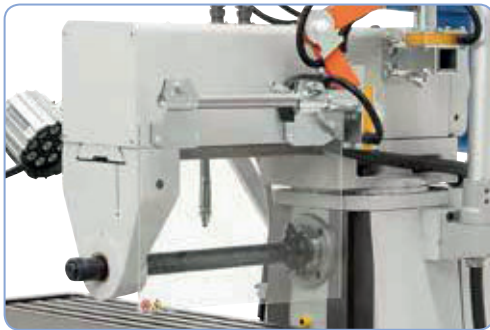
Serially equipped with counter bearing and milling arbor for horizontal milling.