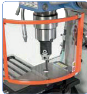
Optionally available: boring head diameter 75 mm and opening wider machine vise FJ 125