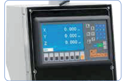
The digital readout in all three axis allows an increase in productivity of up to 50%.