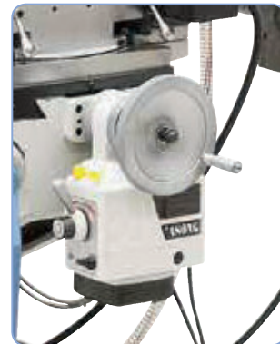
Serially equipped with stepless power feed for the y-axis.