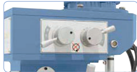
User-friendly, clearly arranged control elements for easy speed adjustment.