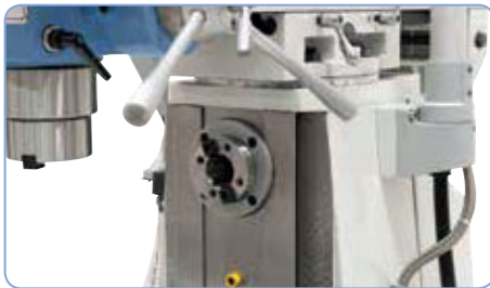
Horizontal spindle largely increases the range of applications.